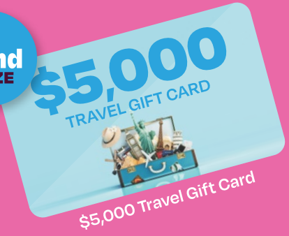
$5,000 Travel Gift Card