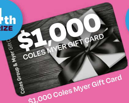
$1,000 Coles Myer Gift Card