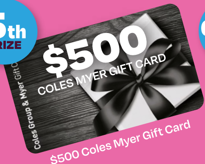
$500 Coles Myer Gift Card