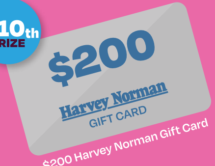
$200 Harvey Norman Gift Card