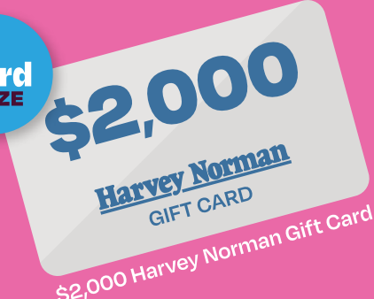
$2,000 Harvey Norman Gift Card